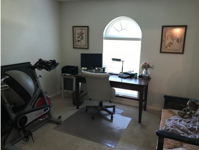
1 of 5 offices