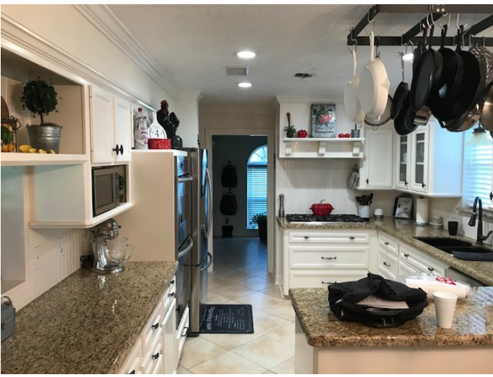
Full Kitchen w/Granite