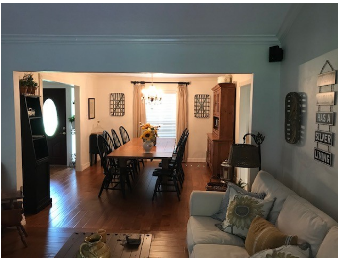
Conference Rm & Exec Office