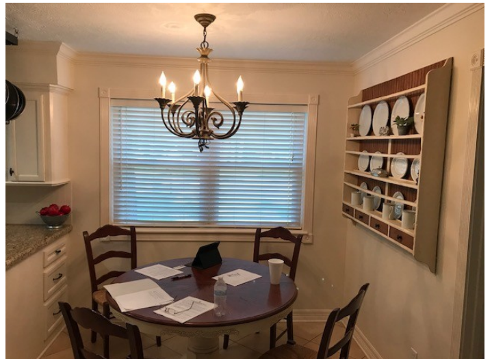
Reception Area Maybe