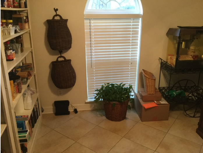
2 of 5 Offices

The LoopNet service and information provided therein, while believed to be accurate, are provided "as is". LoopNet disclaims any and all representations, warranties, or guarantees of any kind.