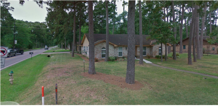
Office Corner Lot