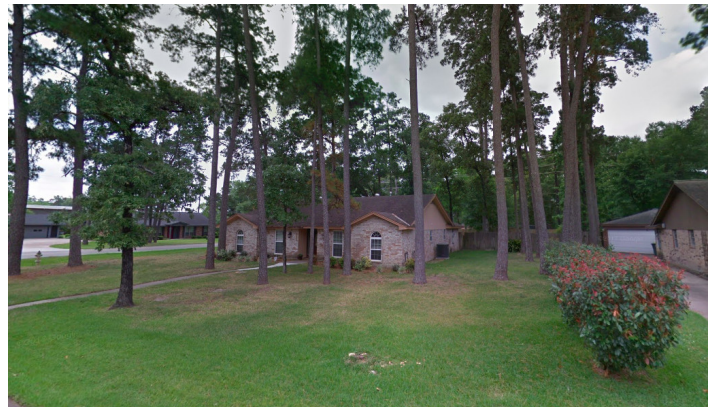
1/2 Acre Lot (approx)