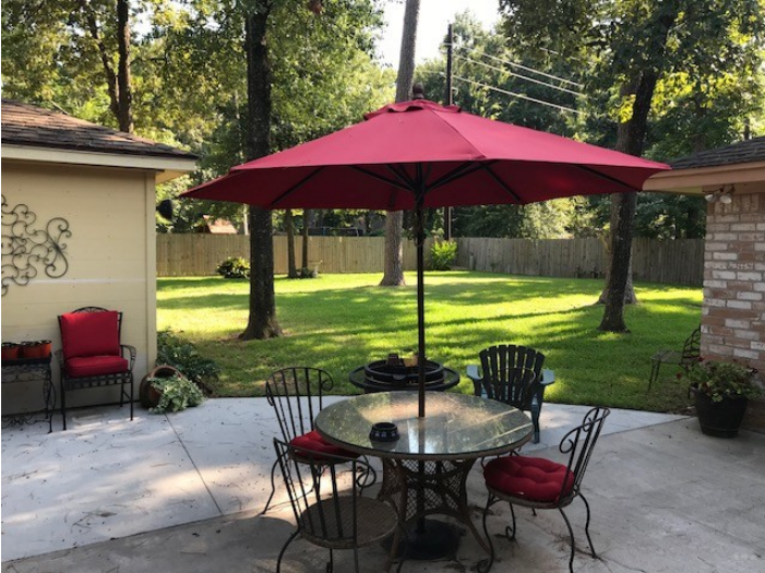
Courtyard & Completely Fenced