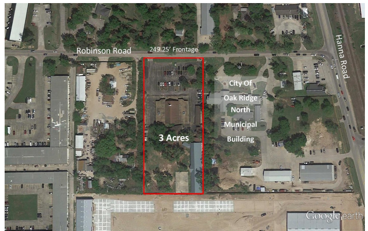
Adjacent to city of Oak Ridge North Municipal Building - 249 feet of frontage along main, busy Robin

Survey with existing improvements (some excluded -ask agent)